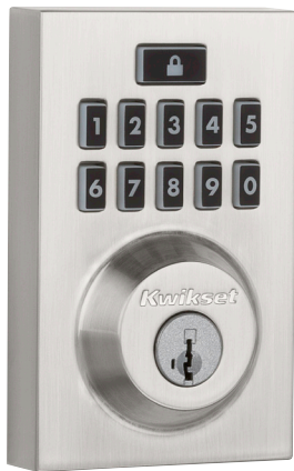
99140-019 914CNT ZW 15 SMTCD CP TPR RCALFD Satin Nickel 15