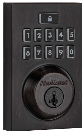
99140-020 914CNT ZW 11P SMTCD CP TPR RCALFD Venetian Bronze 11P