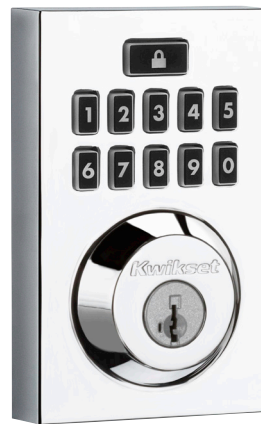
99140-020 914CNT ZW 26 SMTCD CP TPR RCALFD Polished Chrome 26

FINISH AND LIFETIME WARRANTY MECHANICAL ONE YEAR ELECTRONIC WARRANTY