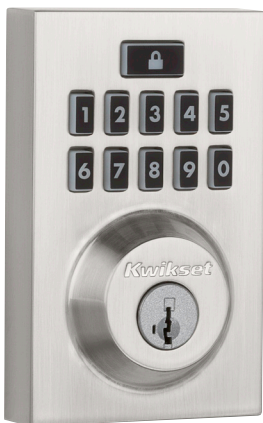
99130-008 Satin Nickel 15 913CNT 15