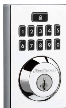
99130-010 Polished Chrome 26 913CNT 26

FINISH AND LIFETIME WARRANTY MECHANICAL ONE YEAR ELECTRONIC WARRANTY