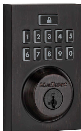
99130-009 Venetian Bronze 11P 913CNT 11P