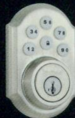
15 Satin Nickel