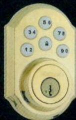
LO3/3 Polished Brass