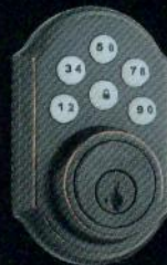
11P Venetian Bronze